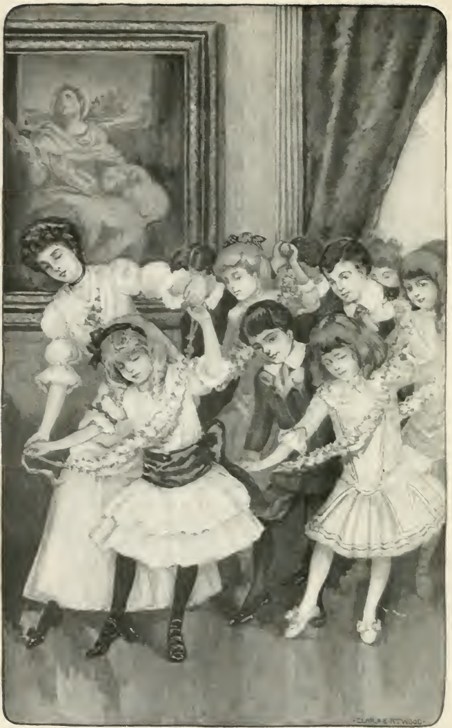
“She gayly led her troop through the pretty dance.” FRONTISPIECE. See p. 57.